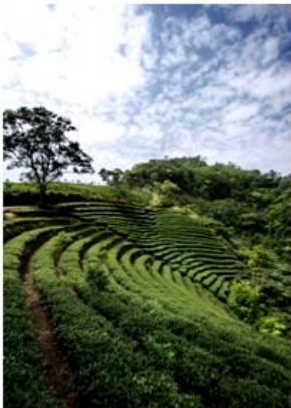
Pinglin Tea Plantation