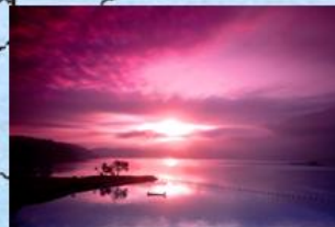
Sun Moon Lake